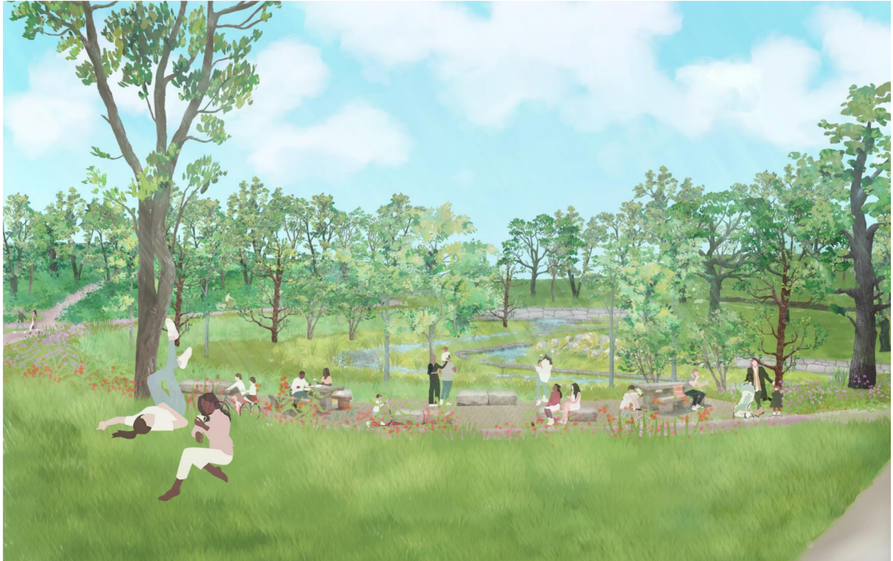
Rendering of Sowinski Park after Doan Brook Stream Restoration