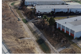
West Creek Flume Fish Barrier Removal