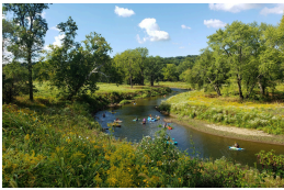
Cascade Metro Park Valley View Area Habitat Restoration