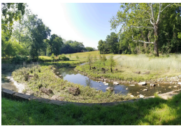
Sowinski Park Habitat Restoration