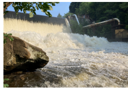
Gorge Dam Removal Sediment Remediation