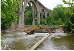
Canal Diversion Dam Removal